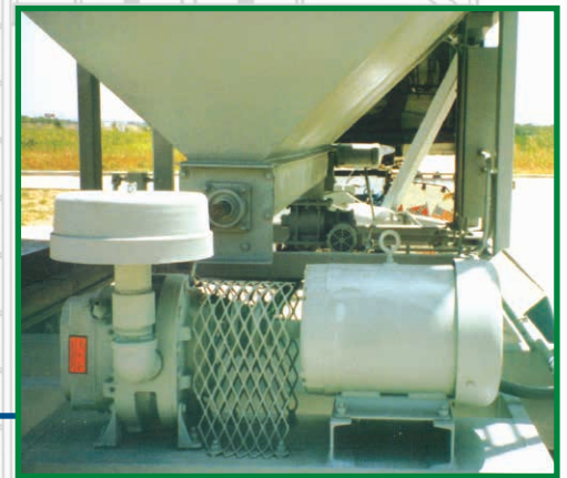
Automatic Recycle System